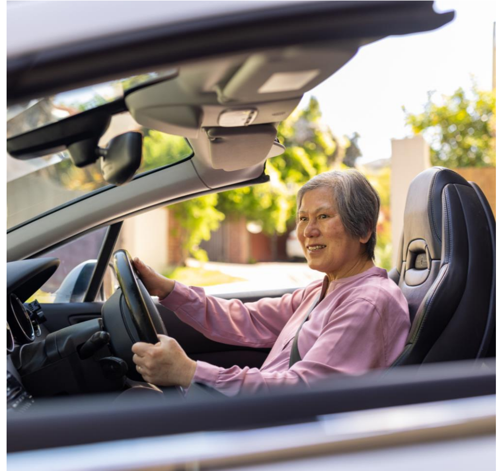
IMAGE: Senior female driving a car on road